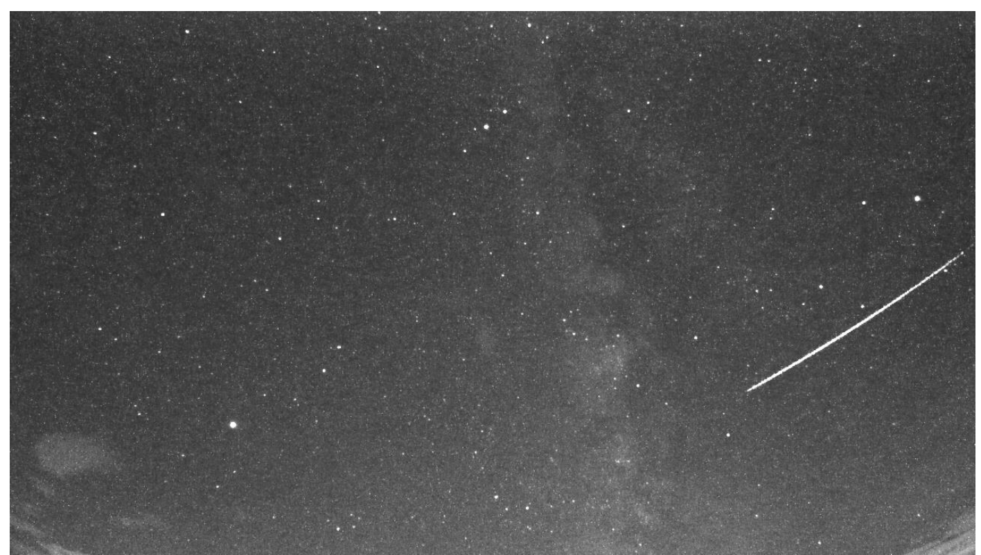
The Milky Way and a meteor from Hum (Croatia) – single maxpixel image.