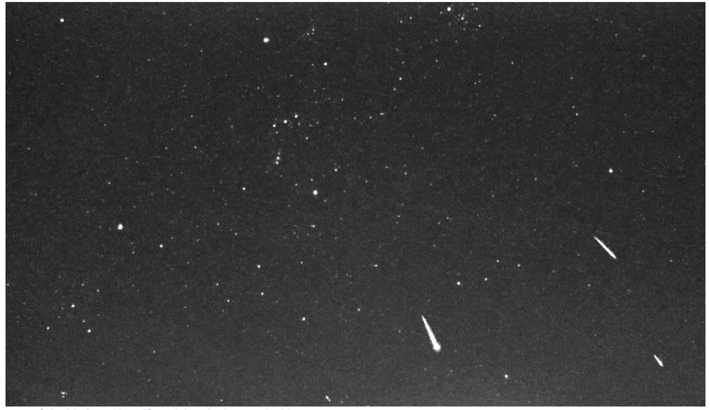
2018 Orionids from Hum (Croatia) – single maxpixel image.