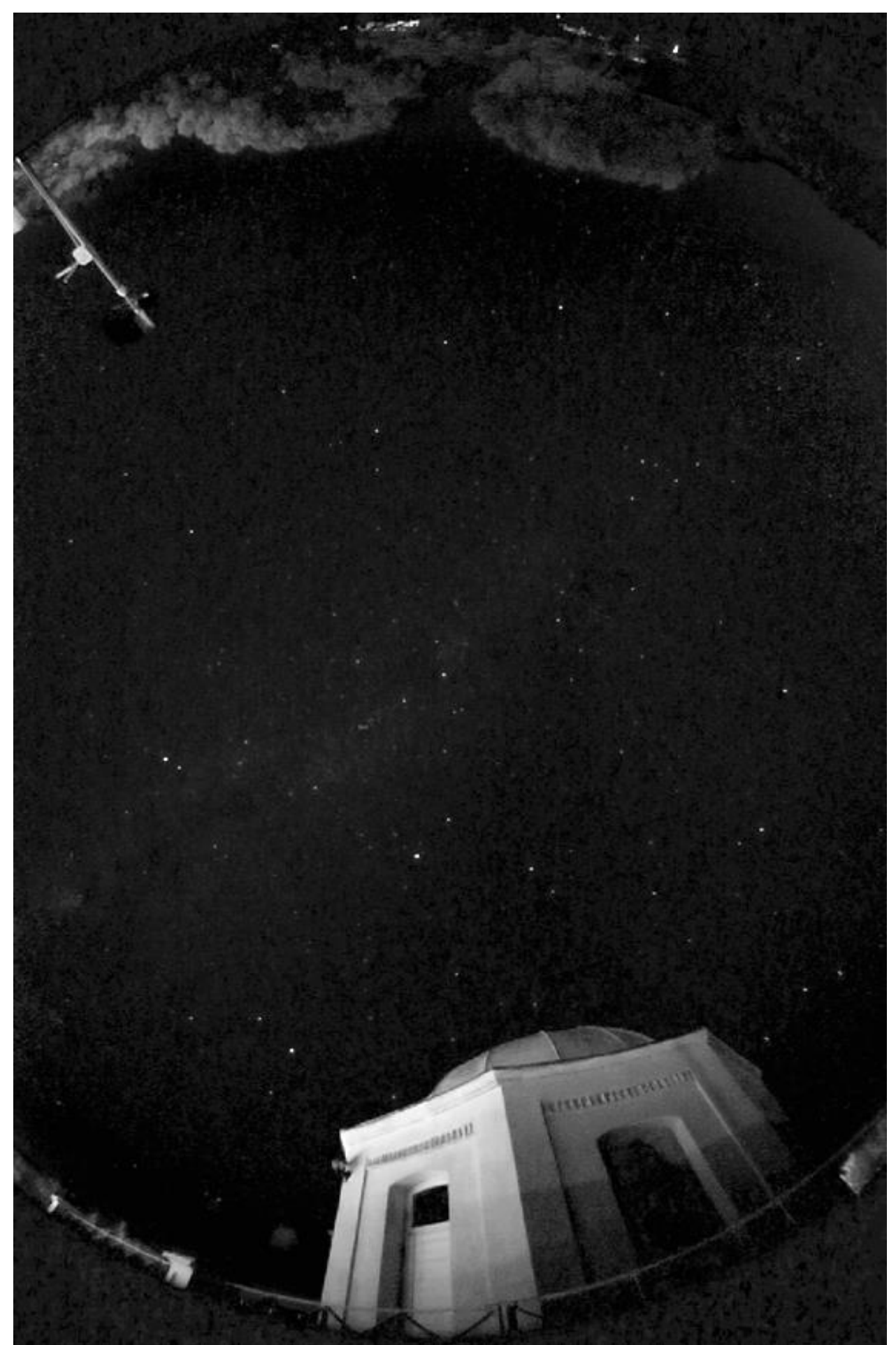
The Milky Way taken from Pula, Croatia (city skies). This is a single average pixel image (average values of 256 video frames, ~10 seconds), with adjusted levels.