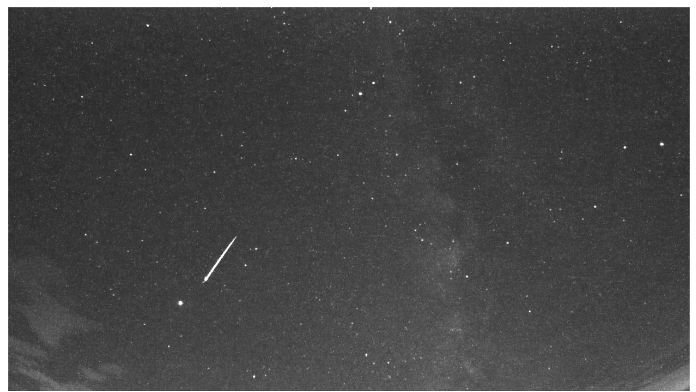
The Milky Way and a meteor from Hum (Croatia) – single maxpixel image.