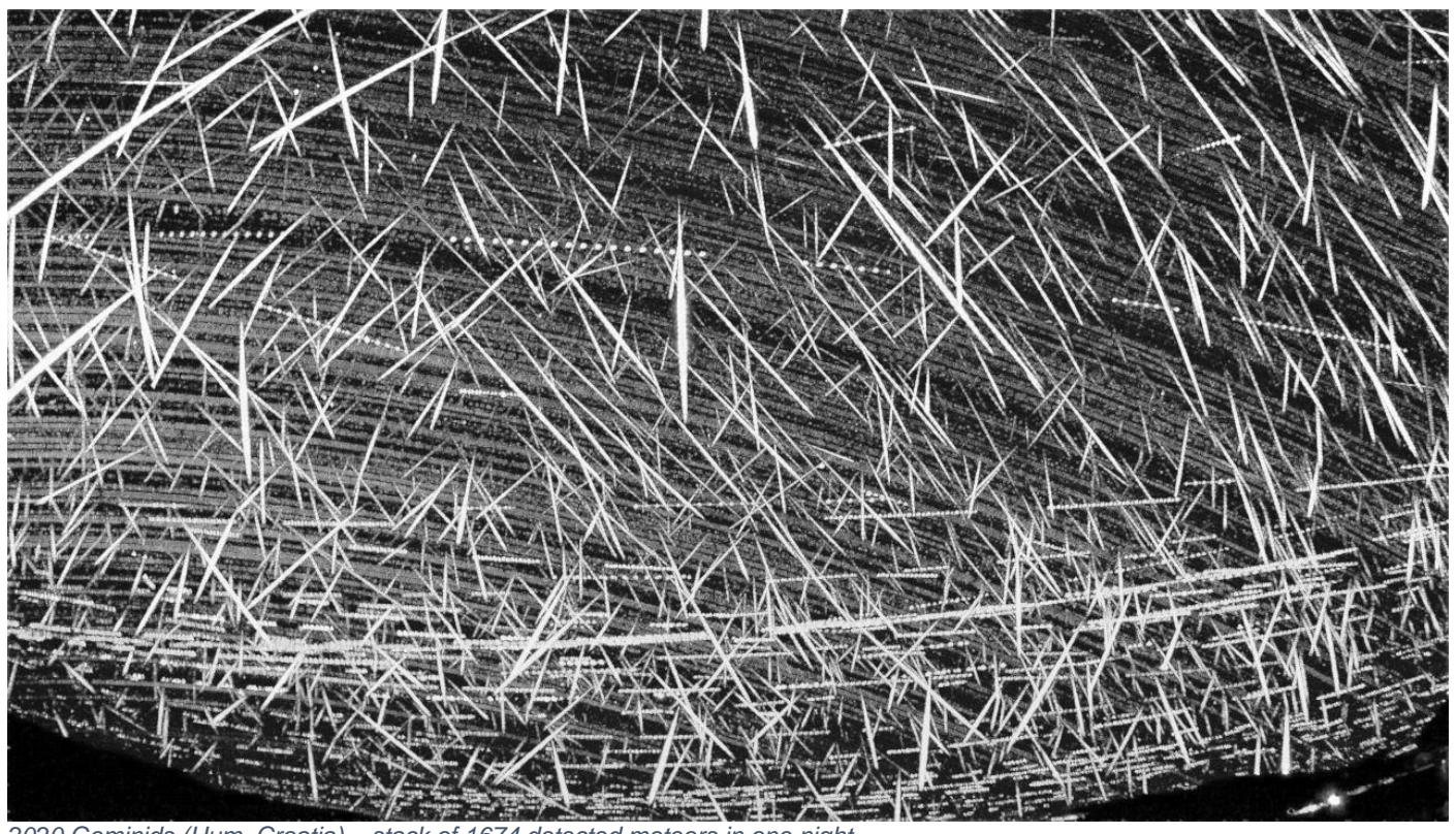
2020 Geminids (Hum, Croatia) - stack of 1674 detected meteors in one night.